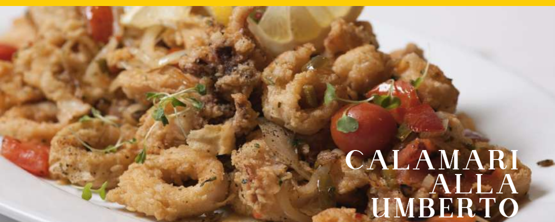
CALAMARI ALLA UMBERTO